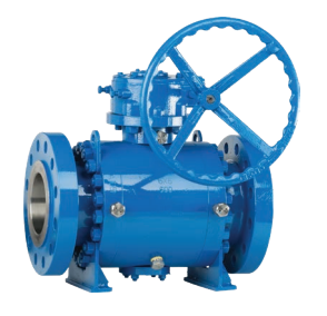
Trident Series 3-pc Forged Trunnion Mounted Ball Valves (API 641 Certified)

C&C API 6D valves are designed to exceed industry standards by maintaining certifications such as API 6D, API 607, API 641, and ASTM B16.34. Available materials consist of carbon steel, low temperature carbon steel, and stainless steel, with available sizes between 2" - 48" and ASME Class 150 to 2500.