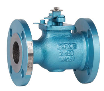
Force BU Series