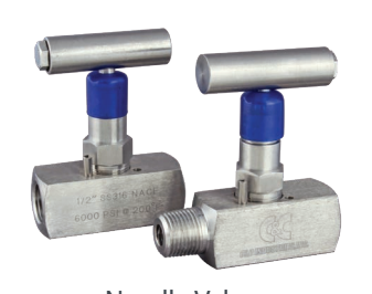
Needle Valves *Mini needle valves also available